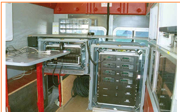
Figure 5-1 View of TRP-1000 mounted inside Chicago Fire Department's Field Communication Van.

The Field Communications vehicle is a refurbished 1992, Ford F350, with an ambulance body. The vehicle is equipped with a hydraulic extendible 50-foot tower that dramatically increases the range of the system. As shown in Figure 5-1 , the components are still housed in their shock resistant cases for increased protection and mobility. These units can still be removed from the ambulance and installed elsewhere relatively quickly.