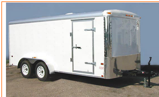
Figure 3-2 Example of enclosed trailer used to store and transport the TRP-1000.

and chairs in the trailer for extended operations.