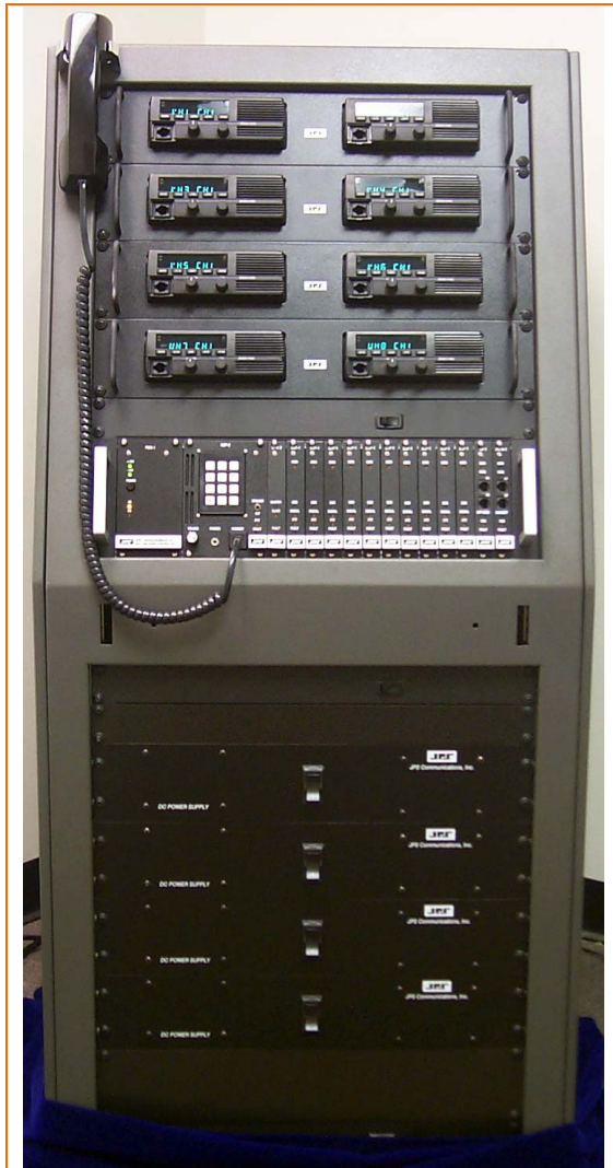
Figure 3-5 Example of fixed-site installation of TRP-1000 package.

Some jurisdictions have integrated the TRP-1000 into their fixed communications and dispatch facility as shown in Figure 3-5 . Others plan to use the unit as part of a backup emergency operations center. Since the TRP-1000 was designed as an interoperability solution, it does allow for the establishment of talk groups and patches between frequencies.