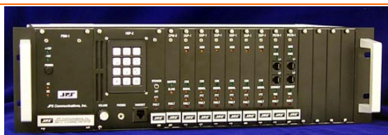
Figure 2-1 ACU-1000 Electronic Console – radio systems patch into this panel, which can be connected to a computer.

This handbook discusses both the fixed base and mobile interoperable communications systems. The ACU-1000 Modular Interconnect System (as shown in Figure 2-1 ) is designed for fixed base operations. This system, manufactured by JPS Communications, Inc., contains the Gateway Switch, and is capable of interconnecting diverse radio, telephone, and cellular units to allow multi-agency communication. This system has the added benefit of adding a backup capability to regular communication and dispatch systems.